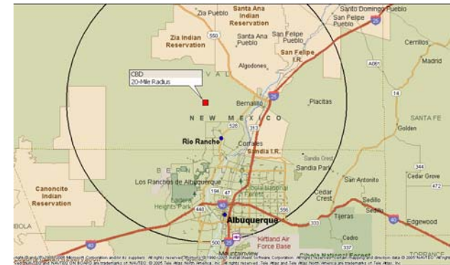
The Rio Rancho CBD's geographic position within the Albuquerque MSA.

The City is in the process of developing its Central Business District (CBD). The CBD is located in the geographic center of Rio Rancho's municipal boundaries. The CBD already includes a new 6,500 fixed seat multi-purpose events center and new City Hall. The CBD will ultimately provide business opportunities for the traditional mix of retail, office, entertainment and dining venues.